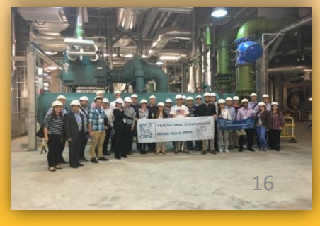
Global YEN conference activities.