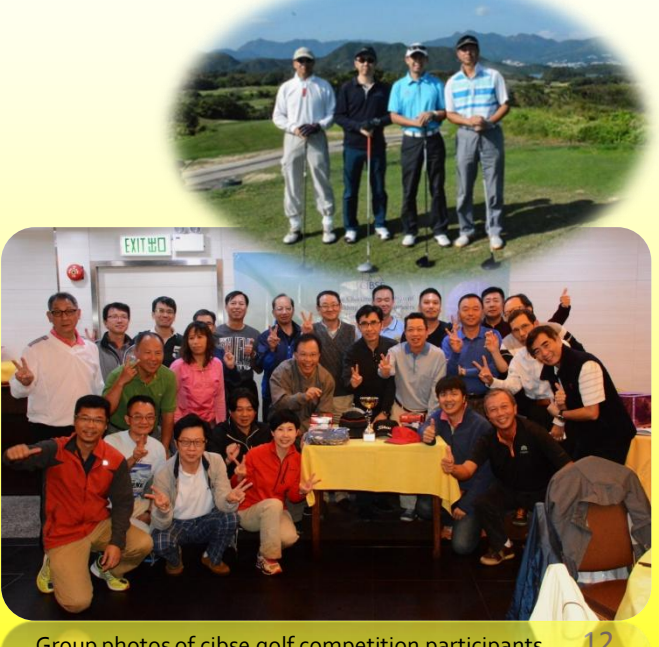
Group photos of cibse golf competition participants.