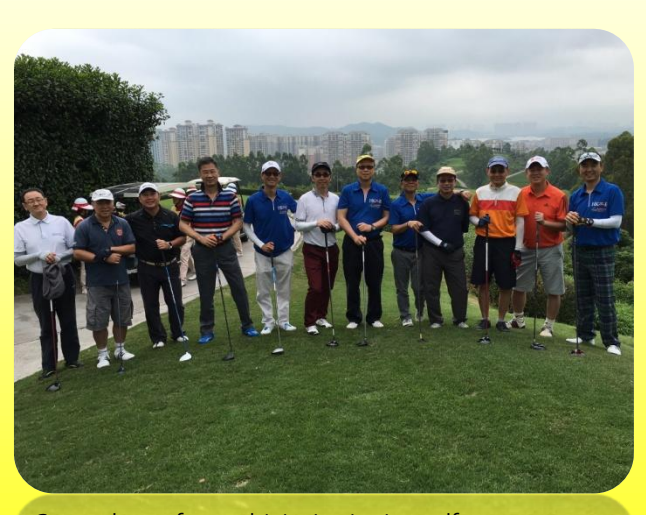
Group photo of annual joint Institution golf tournament Participants.

The CIBSE Golf Competition was held on a sunny day on 11 December 2015 at The Jockey Club Kau Sai Chau Golf Course (North Course). There were a total of 7 flights with 28 participants. Prizes included Best Gross, Nearest to Pin and Longest Drive other than the Champion and runner-ups. Participants enjoyed not only the nice weather and the game, they also enjoyed a delicious seafood dinner in Sai Kung after the competition where the prizes were presented. Members all looked forward to next golf arrangement by CIBSE.