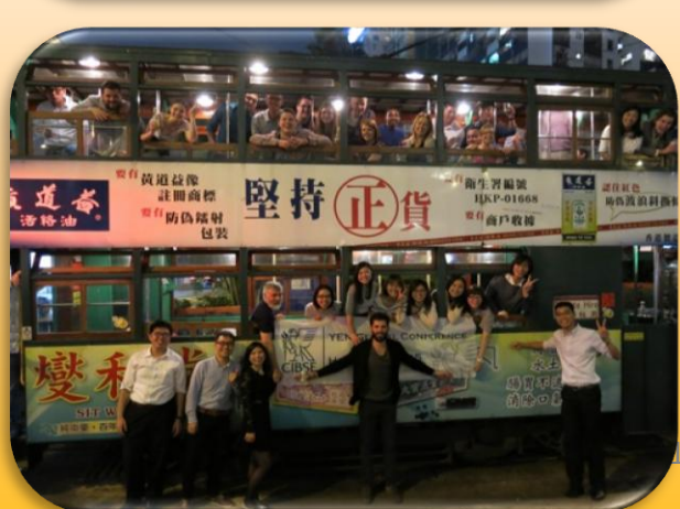
Global YEN conference activities in Hong Kong and Macau.