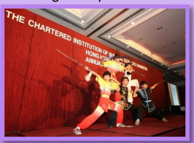
Kung Fu Performance.