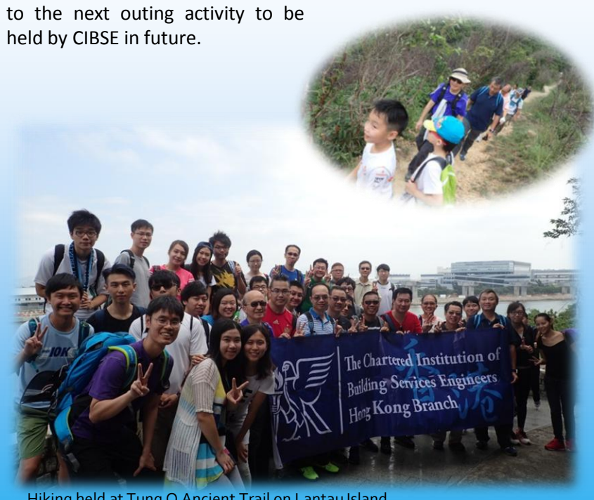
Hiking held at Tung O Ancient Trail on Lantau Island.

All the participants gathered at Tung Chung MTR Station and started the journey at 9am. The route is a well-defined trail and mostly surfaced. Most of the trail is a paved cement footpath and only the last section is an actual mountain trail. It is approximately 14km long. It was a comfortable sunny day. The team spent around 4.5 hours from Tung Chung to Tai O All participants enjoyed hiking in the beautiful surroundings and expressed they are looking forward