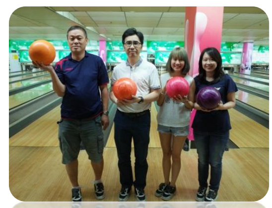
Representatives from CIBSE-HKB participated in the joint institutions bowling competition.

A bowling competition jointly held by ASHRAE-HKC, HKIE-BSD, IFE-HK Branch and CIBSE HKB was successfully held on 30 April 2016. The competition was very exciting with scores close to each other. HKIE-BSD won the champion, with IFE -HK Branch and ASHRAE-HKC being the 1st and 2nd runner up respectively. All participants enjoyed the event very much and had a lunch together afterward.