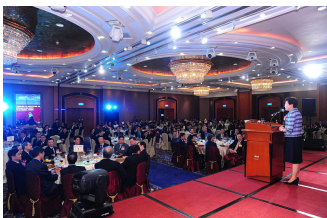
Annual Dinner of 2010

Looking forward to your joining us in the coming Annual Dinner.