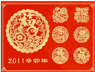
Wish you all a happy, healthy and prosperous Year of the Rabbit!

to and reach the Honorary Secretary by post on or before 22 February 2011. For details, members may refer to our Notification of AGM and our homepage for the Rules for Hong Kong Branch.