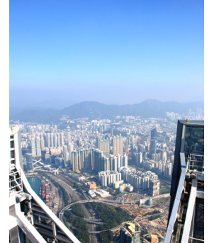
Energy Audit Training Course on 15 & 16 April

All interested members may refer to the notification from the HKB or our website for course details.